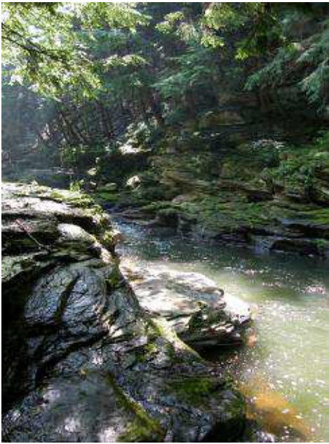
Little Rocky Glen Preserve, Wyoming County