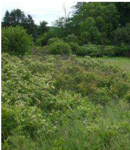
Protected land in Glenburn Twp.