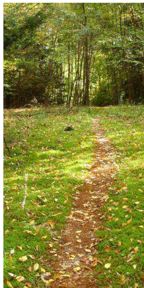
Trail through the woods at Quarry Ridge.