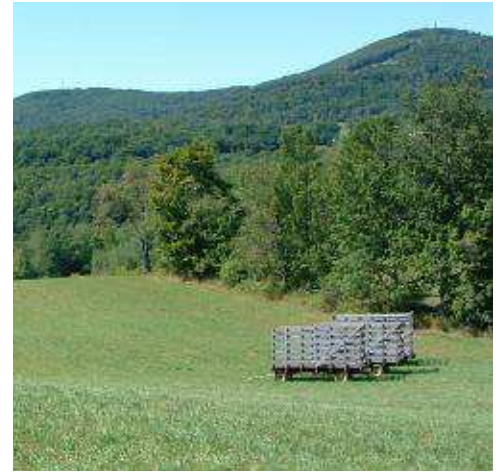
View of Elk Mountain, North and South Knob, from the Felley easement