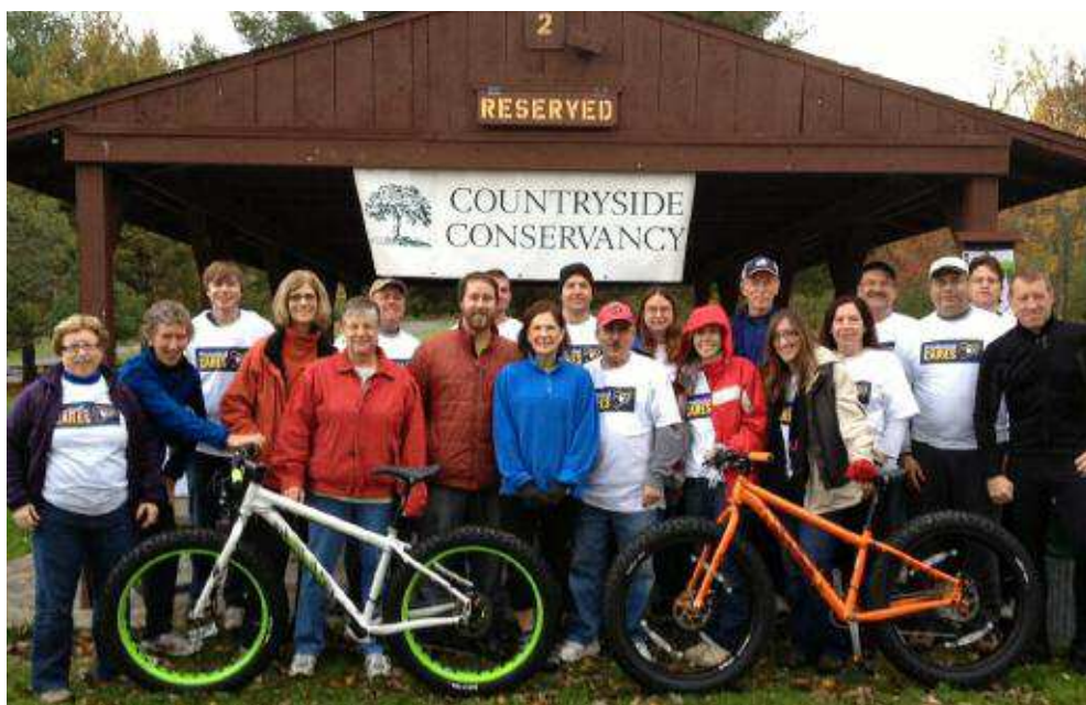
Countryside Conservancy and Prudential Volunteers with demo fat bikes from Sickler's Bike & Sport Shop