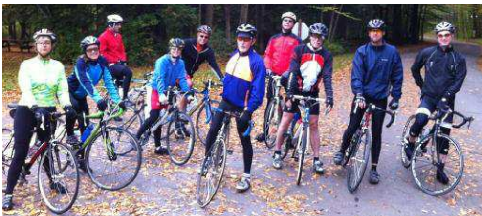
Group of road bikers

Riders had their choice of six routes: three designed for mountain bikes and three designed for road bikes. For those of you who are not cyclists, you can tell a mountain bike by the fat, knobby tires,