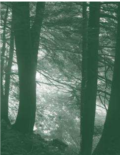
Clinton Township Easement, Wyoming County