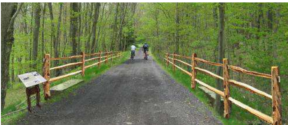
Trolley Trail in the near future.