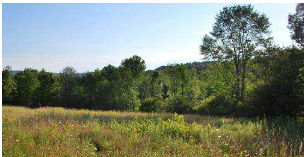
Gateway Preserve, Lackawanna County

Please continue to support Countryside Conservancy, or join if you have not yet taken the opportunity, as we strive to further our efforts in this most worthy endeavor. Opportunities abound through land conservation easements and the recreational Trolley Trail. With your assistance, financially and in volunteering in our many activities, we can achieve much in 2013 and into the future.