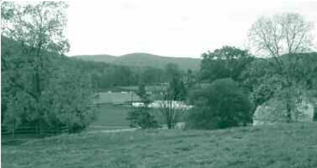
View over Bel Park Farm toward the Susquehanna River